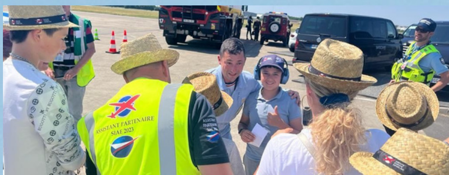
The Patrouille de France not only dazzled spectators in the sky, but also took part in the familyday, reserved for employees and their families, by welcoming their children onto the tarmac. These memorable moments are sure to inspire some of these youngsters to become aircraft pilots.